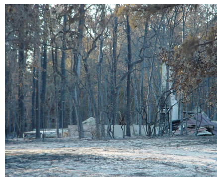
Prescribed fire would have saved homes in 2011.

Rep. McReynolds bill analysis stated that "Currently, a landowner in Texas has the right to use prescribed burning as a land management tool to reduce vegetative fuel that can flare up and cause wild fires. Wildfires pose a serious threat to the state, particularly to suburban areas, and prescribed burning can help to reduce this risk. property damage, personal injury, or death resulting from the burning of vegetative fuel."